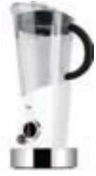
12-EVELAC1 notte bianca glossy lucido