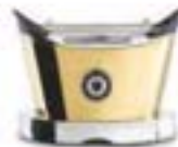
13-SVOLODL gold (PVD) shiny lucido