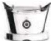
13-SVOLOCR authentic shiny lucido