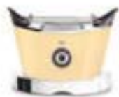
13-SVOLOC crema glossy lucido