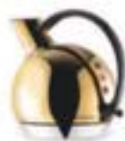
02-GTDLNU gold shiny lucido