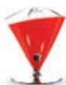
55-VITAC3 hot rosso glossy lucido