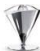
55-SVITACR authentic shiny lucido