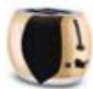
02-RMDL gold (PVD) shiny lucido