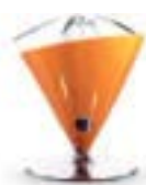
55-VITACO orange glossy lucido