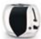
02-RMCR authentic shiny lucido