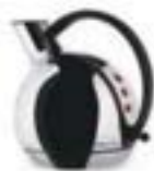
02-GTCRNU authentic shiny lucido