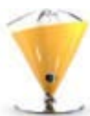
55-SVITAC6 giallo glossy lucido