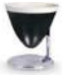
56-UMAN black night matt opaco