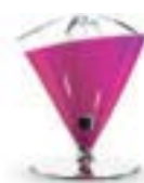
55-VITACL lilla glossy lucido