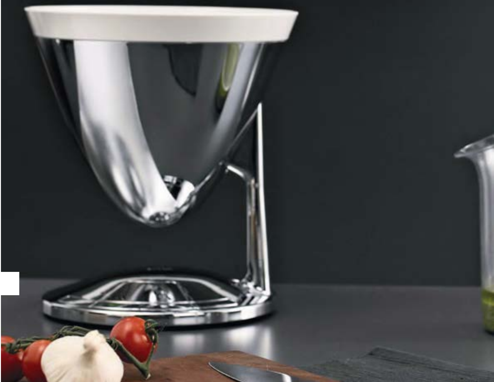
UMA scale | bilancia