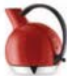
02-GTC3NU hot rosso glossy lucido