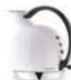
02-GTC1NU notte bianca glossy lucido