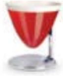
56-UMAC3 hot rosso glossy lucido