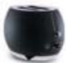
02-RMN black night matt opaco