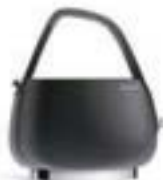
02-JKNNU black night matt opaco