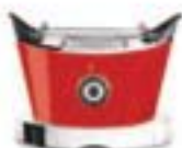
13-SVOLOC3 hot rosso glossy lucido