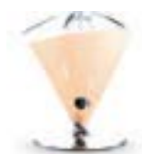
55-VITAC crema glossy lucido