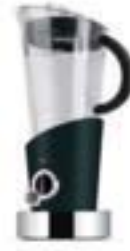
12-EVELAN black night matt opaco