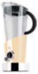
12-EVELAC crema glossy lucido