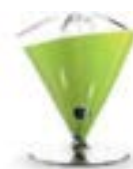
55-VITACM verde mela glossy lucido