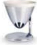
56-UMACR authentic shiny lucido