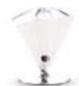
55-VITAC1 notte bianca glossy lucido