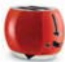
02-RMC3 hot rosso glossy lucido