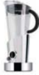
12-EVELACR authentic shiny lucido