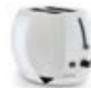
02-RMC1 notte bianca glossy lucido