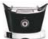
13-SVOLON black night matt opaco