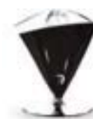
55-SVITAN black night matt opaco