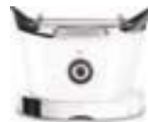
13-SVOLOC1 notte bianca glossy lucido