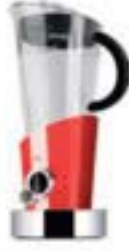
12-EVELAC3 hot rosso glossy lucido