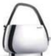
02-JKCRNU authentic shiny lucido