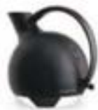
02-GTNNU black night matt opaco