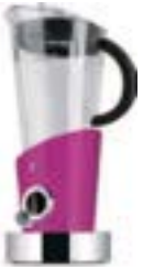
12-EVELACL lilla glossy